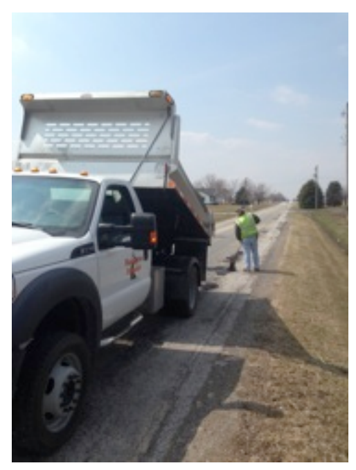
A Road District employee is busy patching small holes on township roads. The severe winter took a huge toll on ALL roads throughout the state.