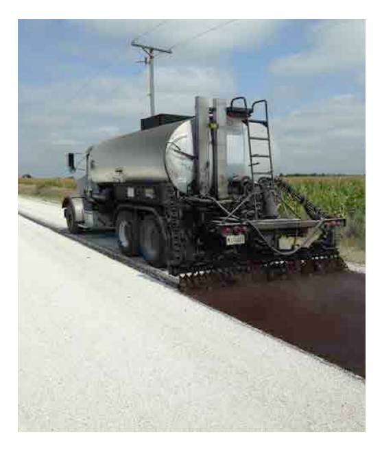
After a road has been properly prepared, the tar and chip process can begin!