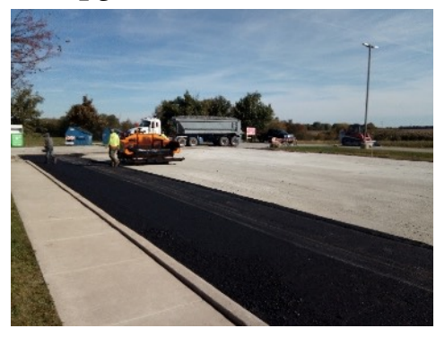
Workers begin laying asphalt on the Township Center parking lot on October 17

The 17-year old parking lot had been deteriorating in recent years and after inspection, it was determined that the base needed to be rebuilt and new asphalt would be required. The Washington Township Road District removed the old asphalt and installed a heavier base before Paving Systems paved the lot. The Township will fully reimburse the Road District for all labor and materials and with the Township & Road District working together, the joint project saved the residents of Washington Township thousands of dollars. The entire project was paid for from the Washington Township Corporate Fund.