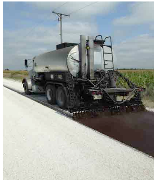
After a road has been properly prepared, the tar and chip process can begin!