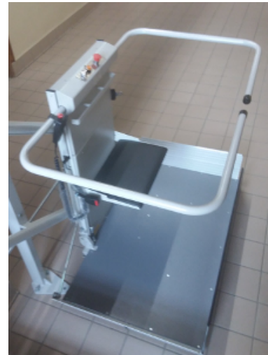
(Above) The new incline platform lift at the Washington Township Community Hall. The seat flips up to allow room for wheelchair access to all levels of the building.

During the past 3 ½ years, the Washington Township Community Hall Board of Managers has been working hard to accomplish many projects to improve and restore the Community Hall: installing a new roof to prevent further water damage, working with ComEd to retrofit all the fluorescent lighting to LED, painting of the entire interior of the building, replacing the broken block windows upstairs, rebuilding the crumbling brick façade on the front of the building, replacing the worn and rusted exterior doors, refinishing the wooden floors upstairs and installing a new water fountain with bottle filler. But perhaps one of our biggest accomplishments was to have an ADA compliant incline platform lift installed to allow full access to all levels for anyone that is physically challenged. Once we receive final approval from the State Fire Marshall, the lift will be fully operational. And it is important to note that all of these projects were completed well within budget so no additional funds were required.