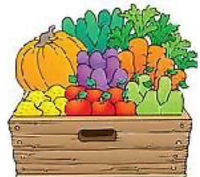
BEECHER FARMER'S MARKET